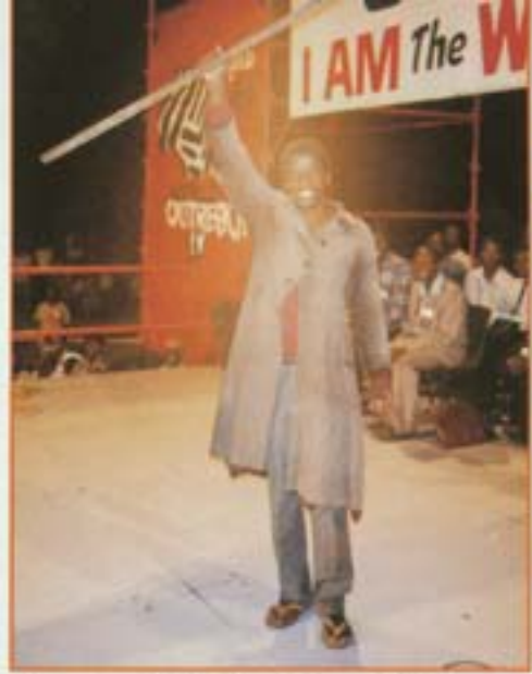
The people shouted for joy at this wonderful miracle. He kept shouting, "God is good, God is good!"

We were also able to see a new church birthed out of this crusade and others grow considerably. Revival came to the local church and also to many Christians who had grown cold in their faith. The Holy Spirit did a great work in the hearts of many of the local pastors,