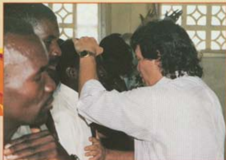
Our Ministers' Conference that was held during our Mongu crusade was a tremendous success. Many lives were changed by the teaching of the Word of God.

were represented in our conference and many of these people traveled a great distance to attend the meetings. These men and women had a tremendous spiritual hunger. It was so encouraging to watch as they seemed to devour the Word of God as it was taught. Their hearts were to see God impact their nation and bring the power of God to their people.