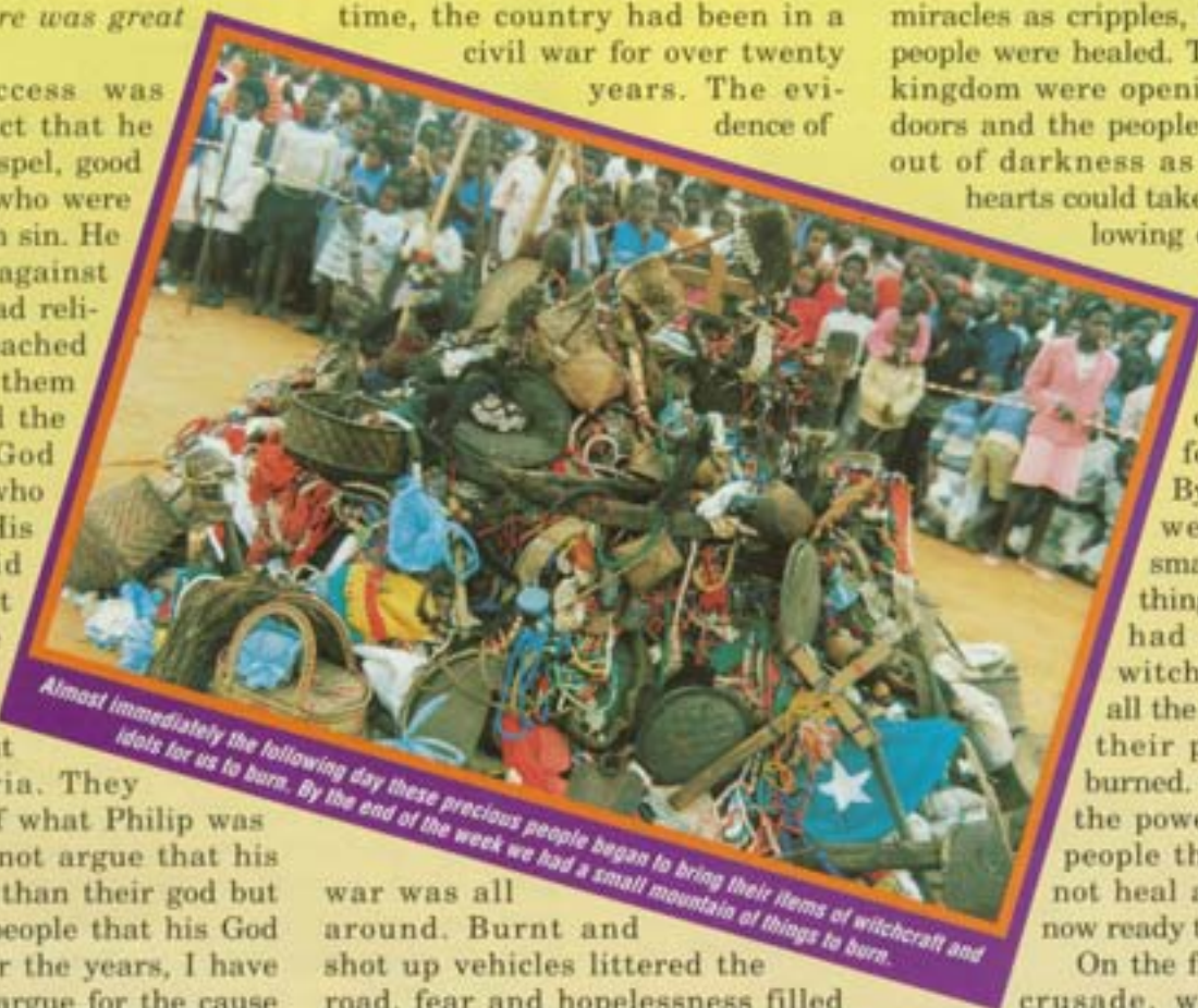
Almost immediately the following day these precious people began to bring their items of witchcraft and idols for us to burn. By the end of the week we had a small mountain of things to burn.

(Continued in the next edition of Outreach Report.)